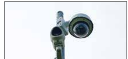
Sii AT is an outdoor thermal security camera used for observing and monitoring sensitive sites.

In an effort to improve safety and reduce crashes, Israel Railways embarked on a major project to identify threats and provide alerts in real time, enabling the railway Safety Control Room's operator to monitor train-road crossings at all times and in any weather conditions, while maintaining low project costs and total cost of ownership (TCO).