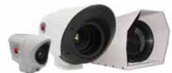
Fixed thermal cameras are ideal for 24/7 wide area threat detection tasks, especially when combined with video analytics.